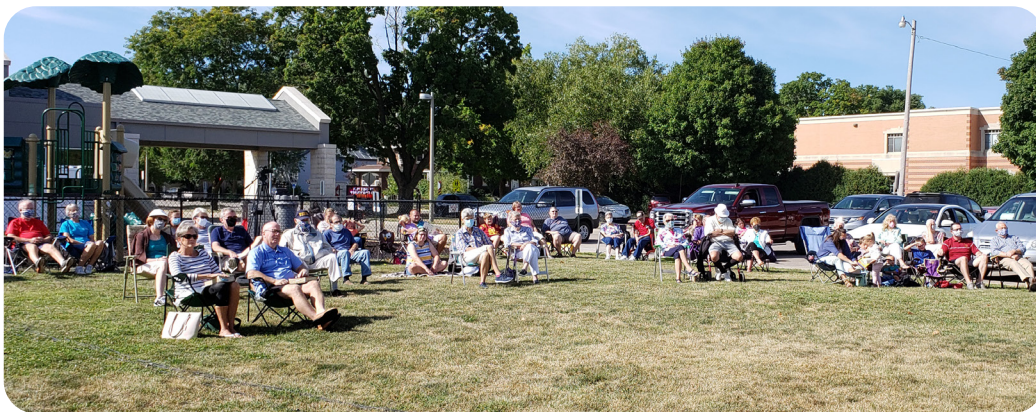
We remained masked and distant, but it was so good to see you at Worship on the Green, Aug 30

Your First UMC leadership team is monitoring Black Hawk County COVID-19 statistics and we are prepared to either continue the process of opening, or to close-down again as needed.