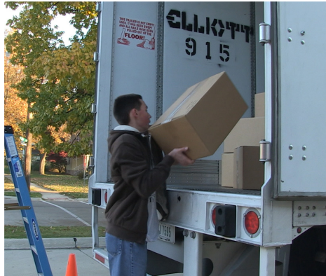
United Methodists from all over Iowa help pack and load donated items @ Ingathering