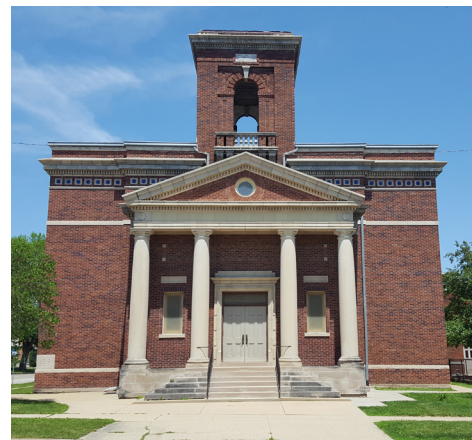
Trinity EUB, Trinity UMC Prairie Springs UMC, Cedar Falls Mennonite Church