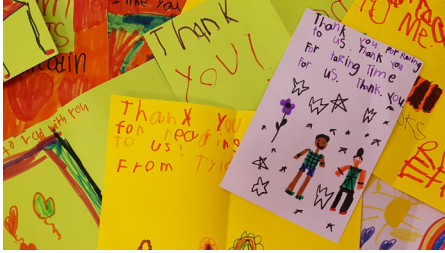
a bunch of thank yous from our Lincoln neighbor kids