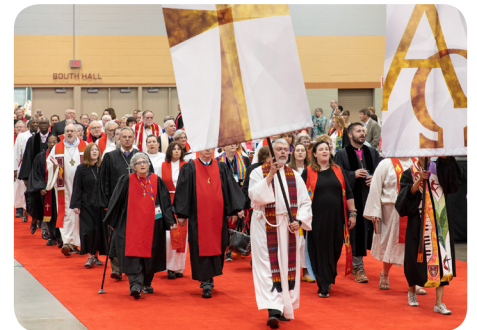
Clergy procession begins Ordination Worship