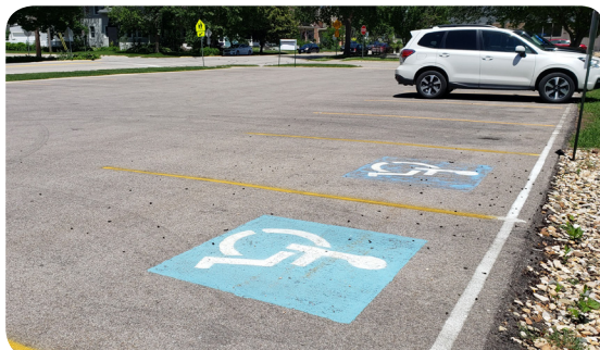
Endowment funds were one source of funding for the re-paving of our parking lot