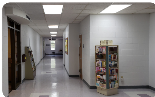
this hall is brighter thanks to new LED lights