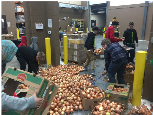
A team of FirstUMC youth sorts onions at the food bank.