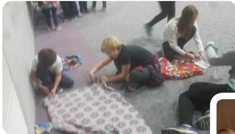
Feathers, some fabric scraps, and our young people working together. Figg approves the project.

In November, we hit the “Service” and “Together” aspects when our Jr/Sr High Youth groups worked with the BLAST kids to make toys for the dogs and cats at the Humane Society Shelter. It’s a project that drew different groups of young people together, and did something nice for our fuzzy buddies.