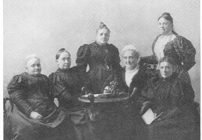
Founders of Woman's Foreign Missionary Society ca. 1895