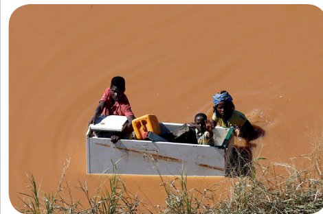
A child is transported inside an empty refrigerator during floods after Cyclone Idai, in Buzi, outside Beira, Mozambique.