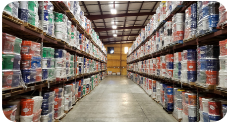
Flood buckets ready to ship out of UMCOR's Sager Brown depot in Baldwin, Louisiana.